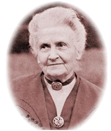
Dr. Maria Montessori

Elk Grove Police Department will be on hand to assist with traffic controls and detours during the event.